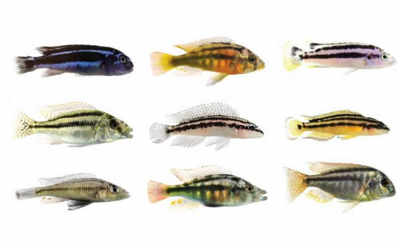
Colourful cichlids with horizontal stripes living in the large African lakes Malawi, Victoria and Tanganyika illustrate the repeating (convergent) process of evolution.

"But that's not all," explains Axel Meyer. "Cichlids are prime examples of evolution. They are extremely diverse in terms of social behaviour, body shape, colour pattern and many other biological aspects, but at the same time, certain features repeatedly evolved independently between the lakes." This principle of repeated evolution—biologists term it convergent evolution—makes cichlids the perfect target to study the genetic basis of this phenomenon. If similar colours and body shapes have emerged in several evolutionary lines independently from each other, this means that evolution reacted to similar environmental conditions in the same way. But how does such evolutionary repetition work genetically?